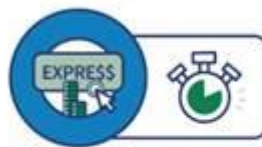
SBA Express Bridge Loans