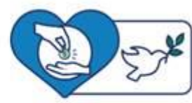
SBA Debt Relief

Paycheck Protection Program (PPP): The Paycheck Protection Program established by the CARES Act, is implemented by the Small Business Administration with support from the Department of the Treasury . The Paycheck Protection Program is providing small businesses with the resources they need to maintain their payroll, hire back employees who may have been laid off, and cover applicable overhead. On June 6, 2020, President Trump signed legislation providing more flexibility and relief for small businesses, including extending the covered period for loan forgiveness from 8 weeks after the date of loan disbursement to 24 weeks and lowering the requirements that 75% of a borrower's loan proceeds must be used for payroll costs to 60%. More information can be found below: